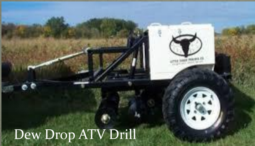
Dew Drop ATV Drill