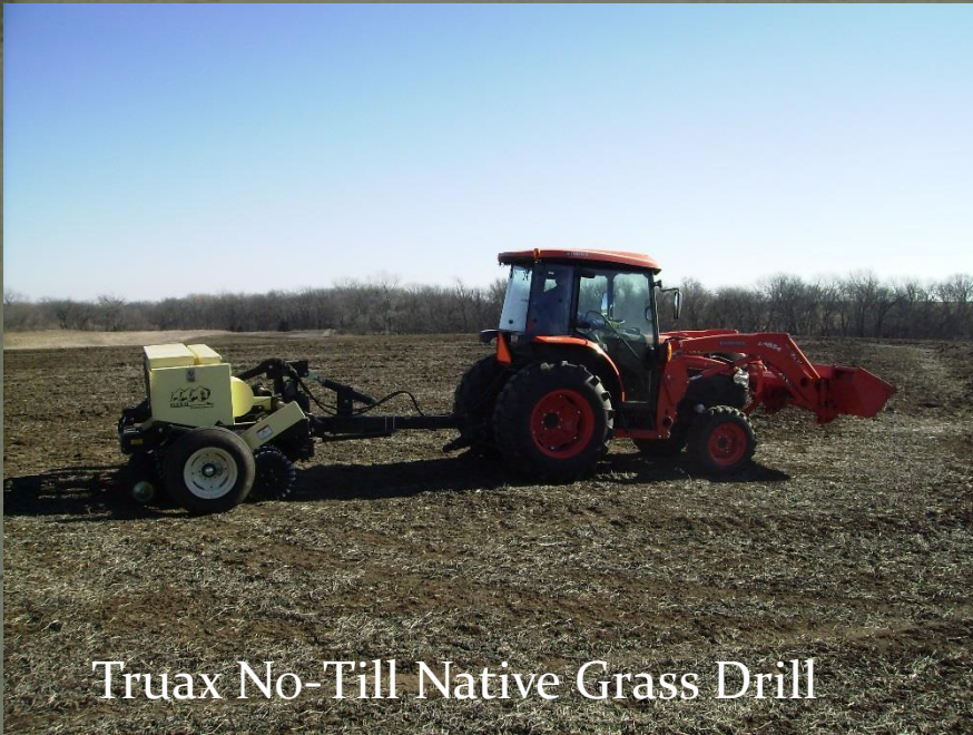
Truax No-Till Native Grass Drill