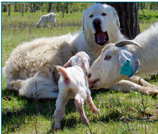
FIGURE 6. Dogs are attracted to animals at parturition and provide added protection when small ruminants are most susceptible to predation.

Health care for LGDs should be planned carefully in consultation with a licensed veterinarian and include scheduled vaccinations, deworming, and heartworm prevention. You should also control external parasites, such as fleas and ticks. Consider rattlesnake vaccines as added protection for LGDs because they are more likely to encounter rattlesnakes than normal pets. Some breeds of guard dogs require grooming to prevent matted coats and heat stress. On occasion, a dog will need help removing porcupine quills. Longevity is one of the most important ways to reduce LGD cost—good health care is essential.