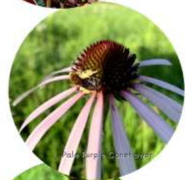
Pale Purple Coneflower